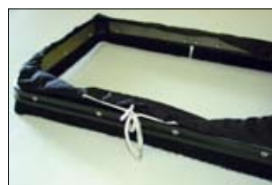
Dust Skirt Assembly For OBS 18DC PN 18455A